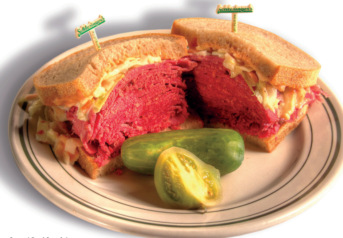
Corned Beef Special